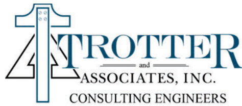
EXHIBIT B SCHEDULE OF HOURLY RATES AND REIMBURSABLE EXPENSES