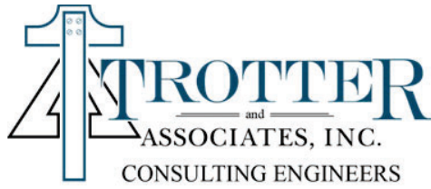
EXHIBIT D CONTRACT ADDENDUM