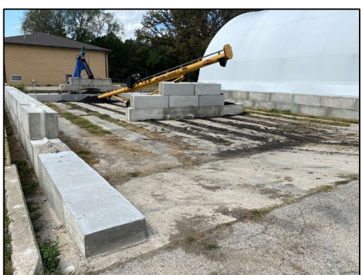
30-foot rental conveyor proved successful.

• 2021 (Now): A Westfield WRX 61-10 grain auger was ordered and delivered to the treatment plant. This conveyor measures 61-feet in length and has a 10-inch diameter tube for moving the sludge through. At a delivered cost of $12,429, this measures at a much lower cost to a "wastewater" sludge conveyor of the same length at an approximate price of $122,000.