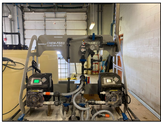
We borrowed heavily from this design to build our own.

Televising Van Upfitting – Staff have begun selecting items to turn the cargo van that was purchased last fall into a mobile sewer televising unit. The van will be equipped with equipment for deploying and operating a robotic camera that is used to inspect and document all the District's gravity sewer mains via monitors and data storage in what will be a mobile workstation. I met with a local vehicle upfitter to go over the van and what we are looking to do with it. They may be able to assist with the installation of a rooftop HVAC unit and help with determining if a generator will be required to power the equipment, or if a battery bank and solar panels may be an option. Our goal is to have this van ready to roll out and televise this spring.