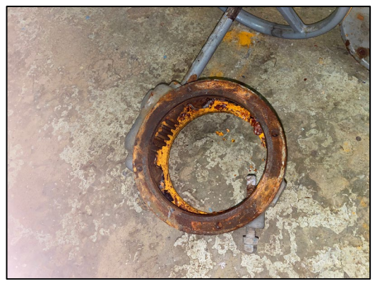
Actuator components showing their age.

Sludge Conveyor – The new sludge conveyor has arrived! This is an exciting moment and big step towards seeing what has become a bit of a passion project completed. Here is where we have been and where we are going with this project.