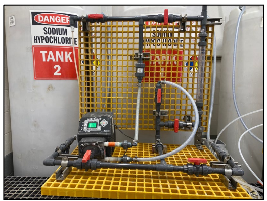
Our new homemade chemical feed skid.

Disinfection Chemical Pump Skids – Two "skids" have been fabricated by District staff to provide control over where disinfection chemicals are drawn from and to meter the flow of the chemicals. The long term goal is to eventually move to a disinfection method utilizing UV light to kill pathogens in the treated effluent leaving the treatment plant. However, the existing disinfection system was in need of significant attention. There were routine leaks creating a waste of resources as well as safety hazards involved with the clean up. Last year two new chemical feed pumps were purchased, and the feed system was redesigned to reduce the potential for leaks. These pumps are identical to the one used to feed the chemical utilized in Phosphorus removal. The chemical pumps for the phosphorus removal were purchased already installed on a premanufactured skid with intake and discharge piping along with metering and backflow components. This was at a cost of approximately $6,000. When it came time to set up the disinfection system, we understood that this would likely only need to be in service for several more years. Using the phosphorus removal skid as an example, we were able to fabricate two of our own skids for about $1,000 each. Digital flowmeters have been recently ordered and will allow for a more refined measurement of our chemical consumption and feed rates.