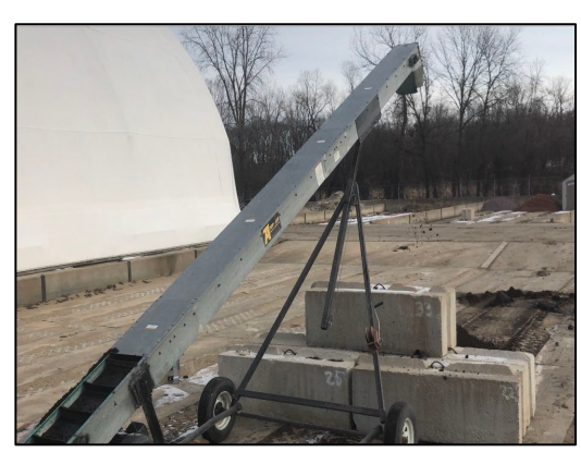
The first conveyor proved unsuccessful yet educational.

• 2020: Following a lot of trial and error after what appeared to be some initial success with an agricultural belt conveyor that was purchased, we hit a roadblock with the sludge causing the belt to slip on the drive mechanism. Having learned a lot from this experience we decided to rent a 30-foot auger-style conveyor from a local farm supplier and see how this approach worked. After several weeks of operation, it was concluded to be a successful method. There are a surprising number of options to consider when purchasing an agricultural grain conveyor for the purpose of conveying sludge. Careful examination of available options commenced. In the meantime, the new cover for the storage bed was installed. This would keep the sludge conveyed to this bed our of the rain and snow to stay dry. Late in the year, a decision was made on a conveyor, and it was ordered.