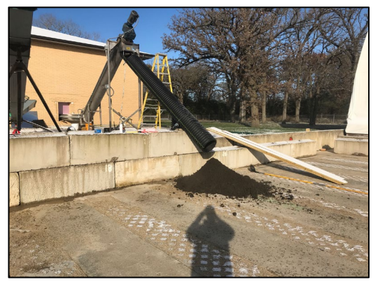
The first step in the evolution of the new conveyance system.

• 2020: Following a lot of trial and error after what appeared to be some initial success with an agricultural belt conveyor that was purchased, we hit a roadblock with the sludge causing the belt to slip on the drive mechanism. Having learned a lot from this experience we decided to rent a 30-foot auger-style conveyor from a local farm supplier and see how this approach worked. After several weeks of operation, it was concluded to be a successful method. There are a surprising number of options to consider when purchasing an agricultural grain conveyor for the purpose of conveying sludge. Careful examination of available options commenced. In the meantime, the new cover for the storage bed was installed. This would keep the sludge conveyed to this bed our of the rain and snow to stay dry. Late in the year, a decision was made on a conveyor, and it was ordered.